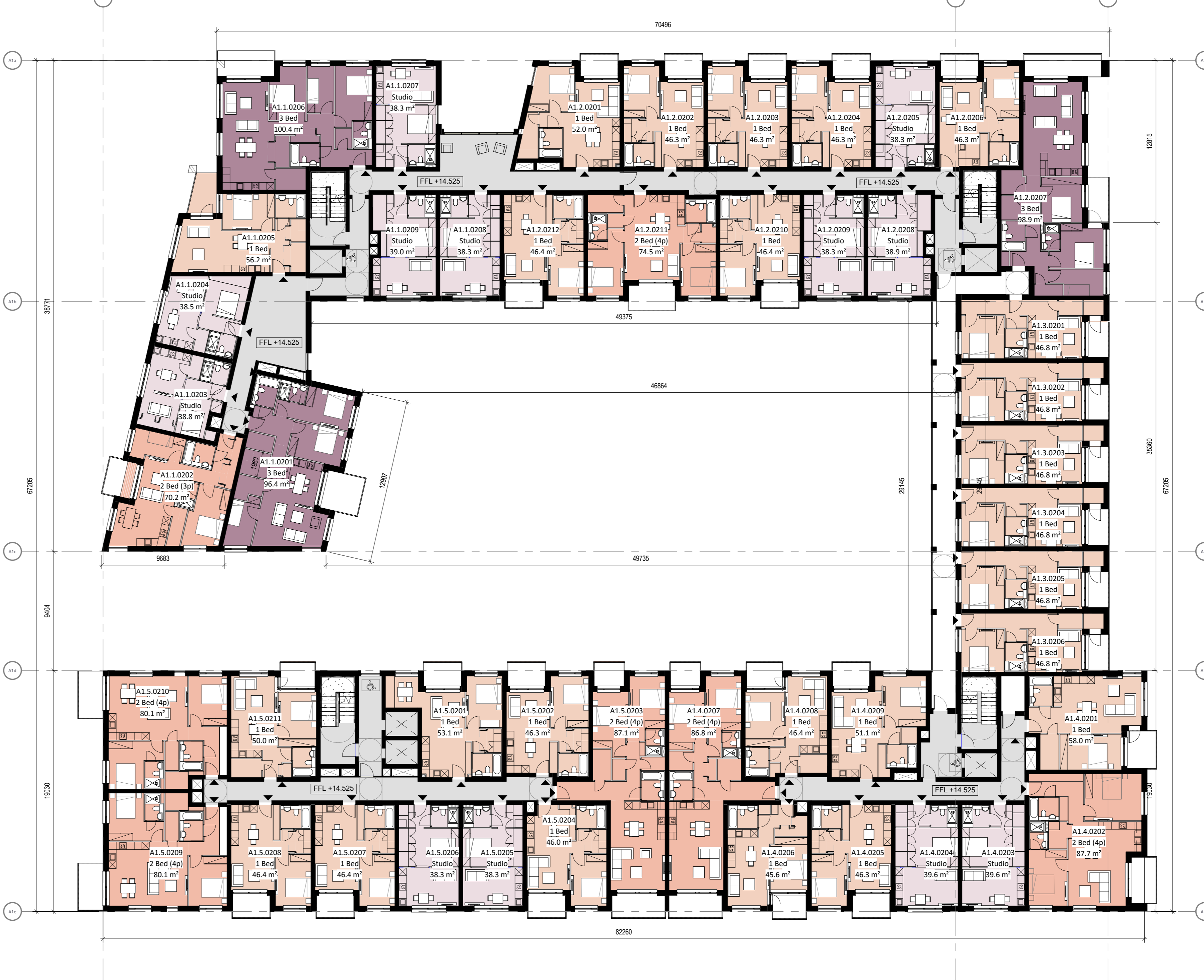
4 BLOCK A1 - LEVEL 02 1:200