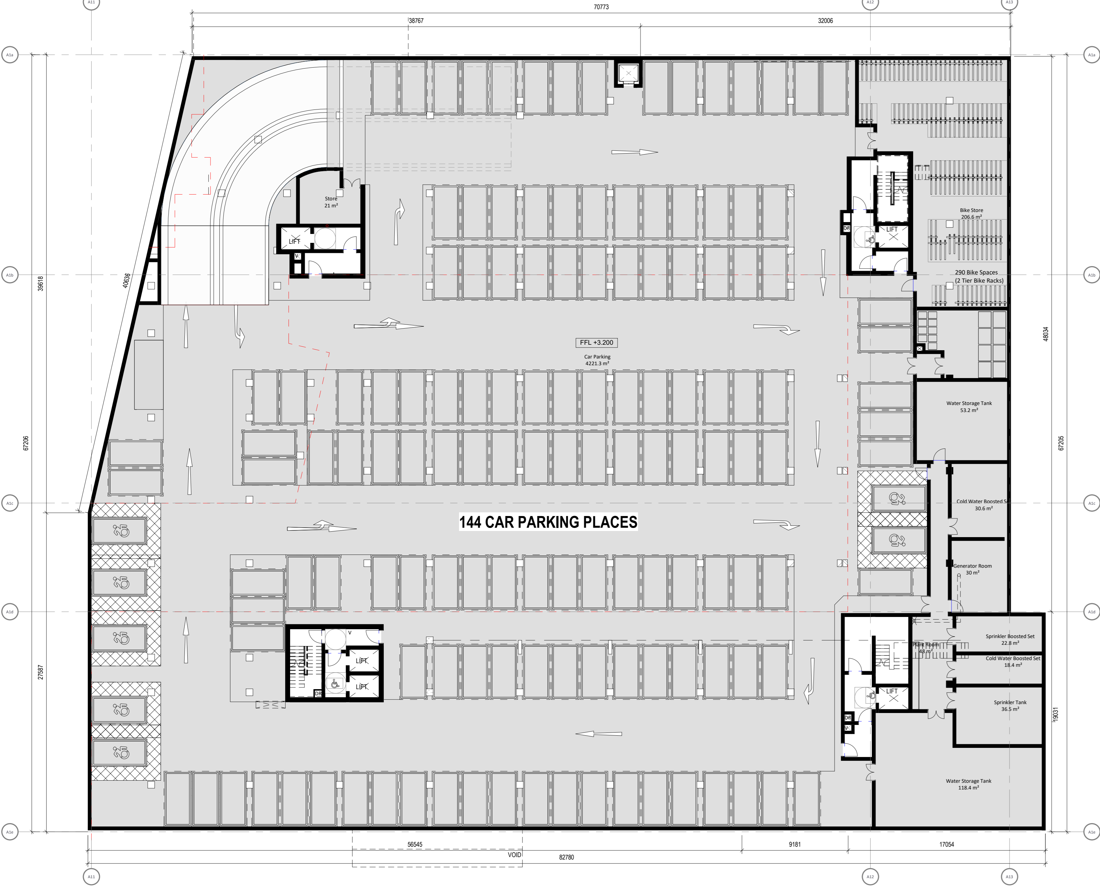
1 BLOCK A1 - LEVEL B01 1:200