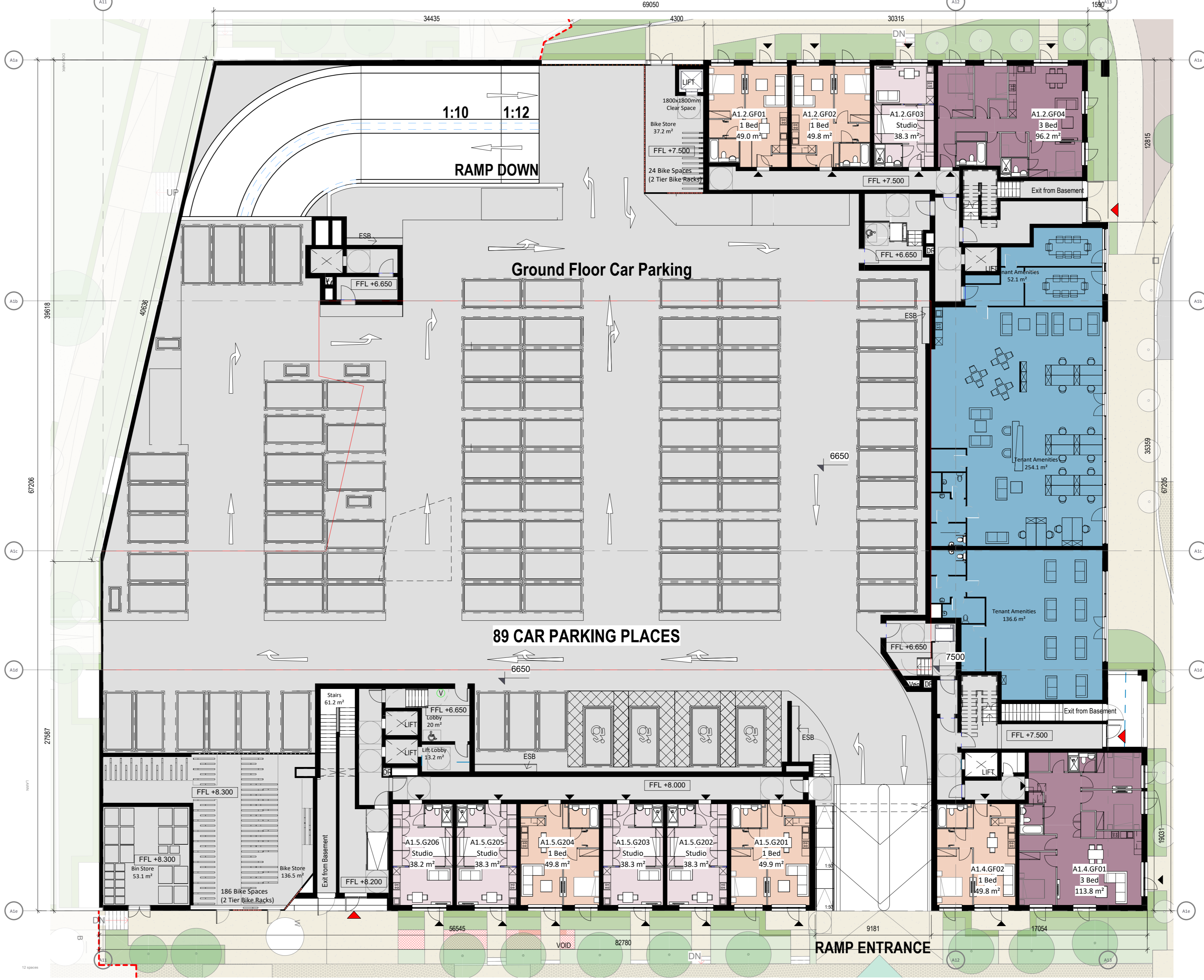
2 BLOCK A1 - LEVEL 00 1:200